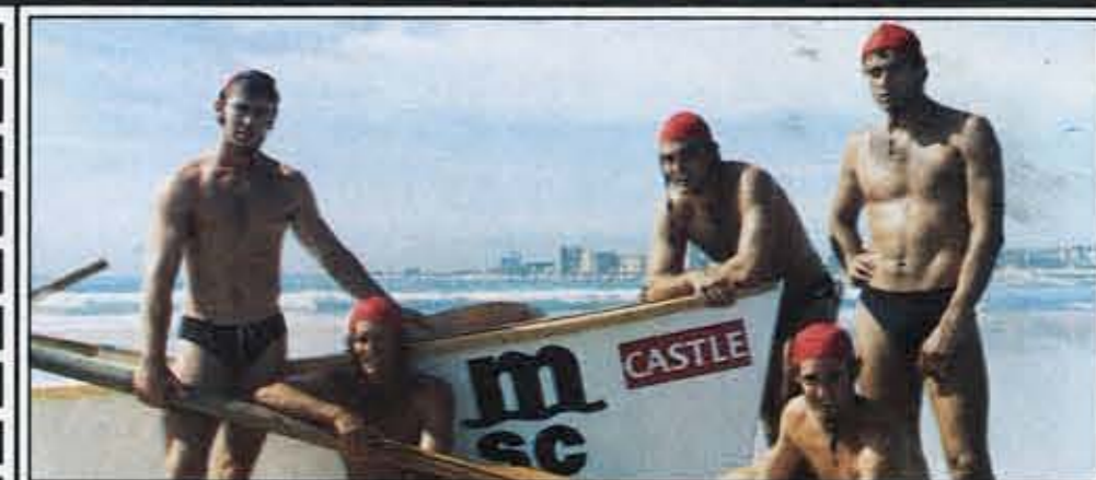
DURBAN SURF LIFE SAVING CLUB MSC transported the life - saving boat (pictured above) from Australia to South Africa and assisted the Durban Surf Life Saving Club by reducing the cost of transportation to an amount which made the operation viable. The team in the photograph were prominently placed in all three races which were part of the recent National Championships held in Durban.