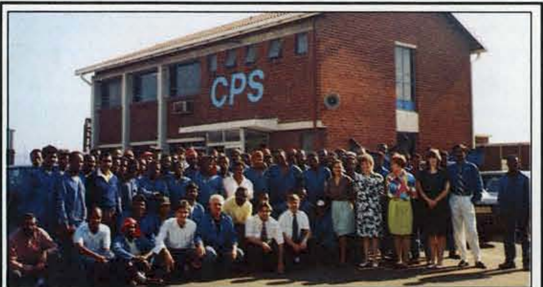
Pictured above are staff of Container Parks and Services in front of the Administration Building