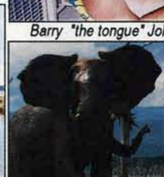
An elephant approaches