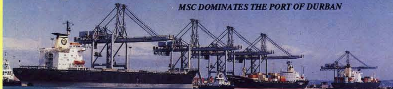
MSC DOMINATES THE PORT OF DURBAN

Pictured above are the "Alexa", "MSC Ariane" and "Sextum" all simultaneously loading and discharging containers at the terminal. MSC have always considered Durban to be their "home" port and are also the biggest single user of the dry dock facility; even those vessels which are not dedicated to the Southern African route are brought to Durban when routine maintenance is necessary. There have been up to an incredible 12 MSC vessels in Durban Harbour on the same day, and a visitor to the port was recently heard to comment that there were so many MSC funnels in evidence that he actually thought that the MSC logo belonged to Portnet!!!