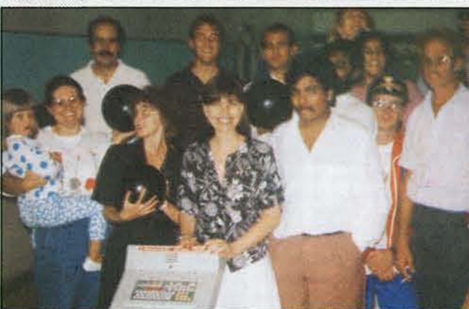
Ten-Pin Bowling 19th March 1993 A group of staff and their families and friends who participated.