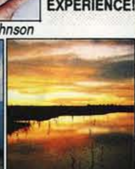
Sunset on Kariba