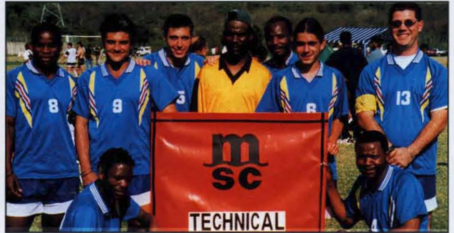
MENS TECHNICAL TEAM