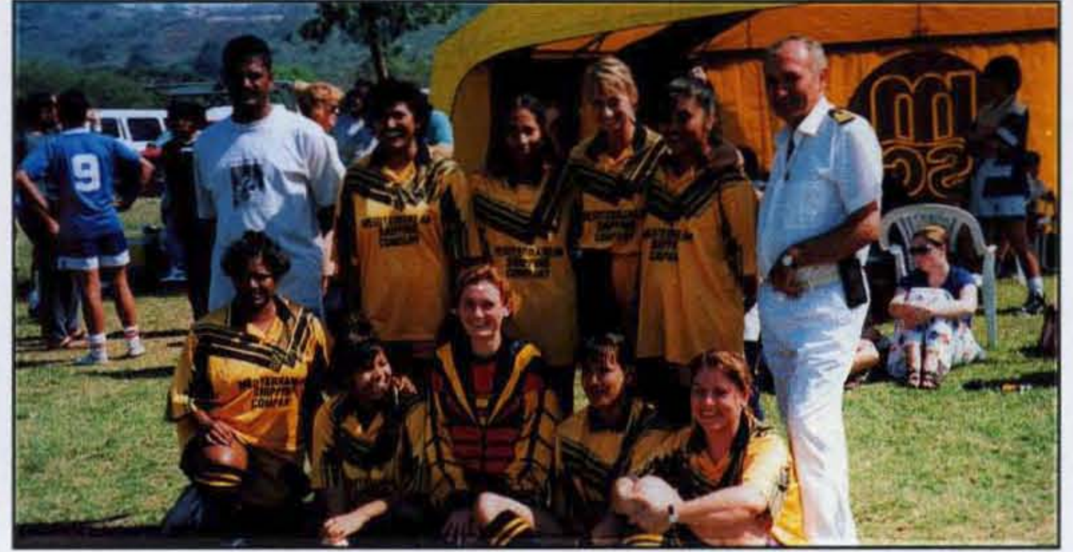
LADIES "B" TEAM

Unfortunately the ladies did not retain the trophy they had held for four years. There was, however, a dispute over the legitimacy of the team who knocked them out of the quarter final