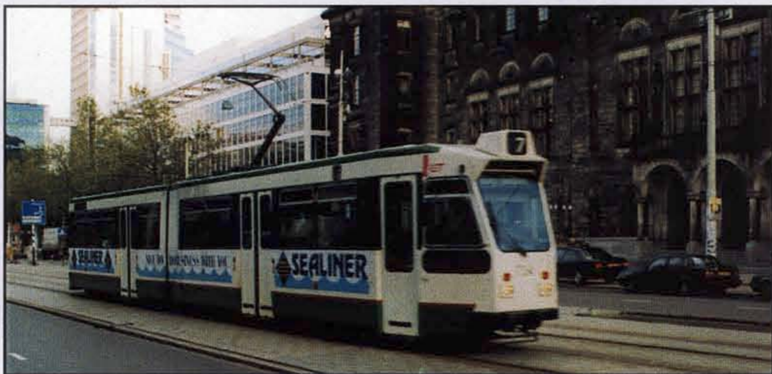
A trolley, with an advertisement for Sealiner, in front of the Town Hall of Rotterdam