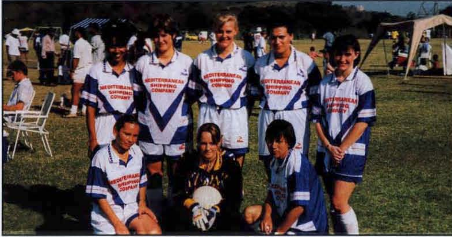
LADIES "A" TEAM

Unfortunately the ladies did not retain the trophy they had held for four years. There was, however, a dispute over the legitimacy of the team who knocked them out of the quarter final