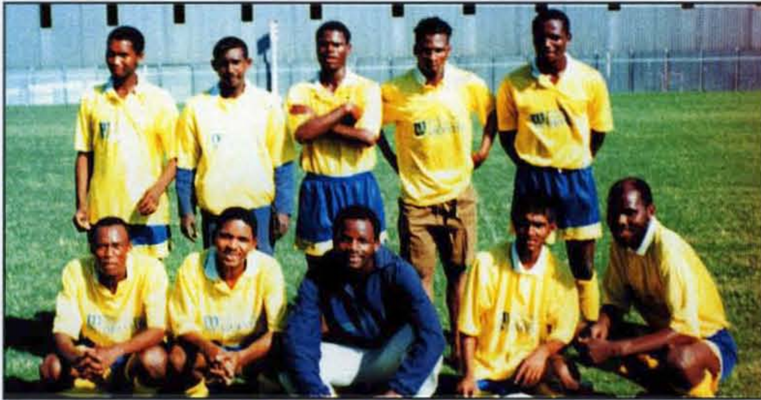
MENS MSC DEPOT TEAM