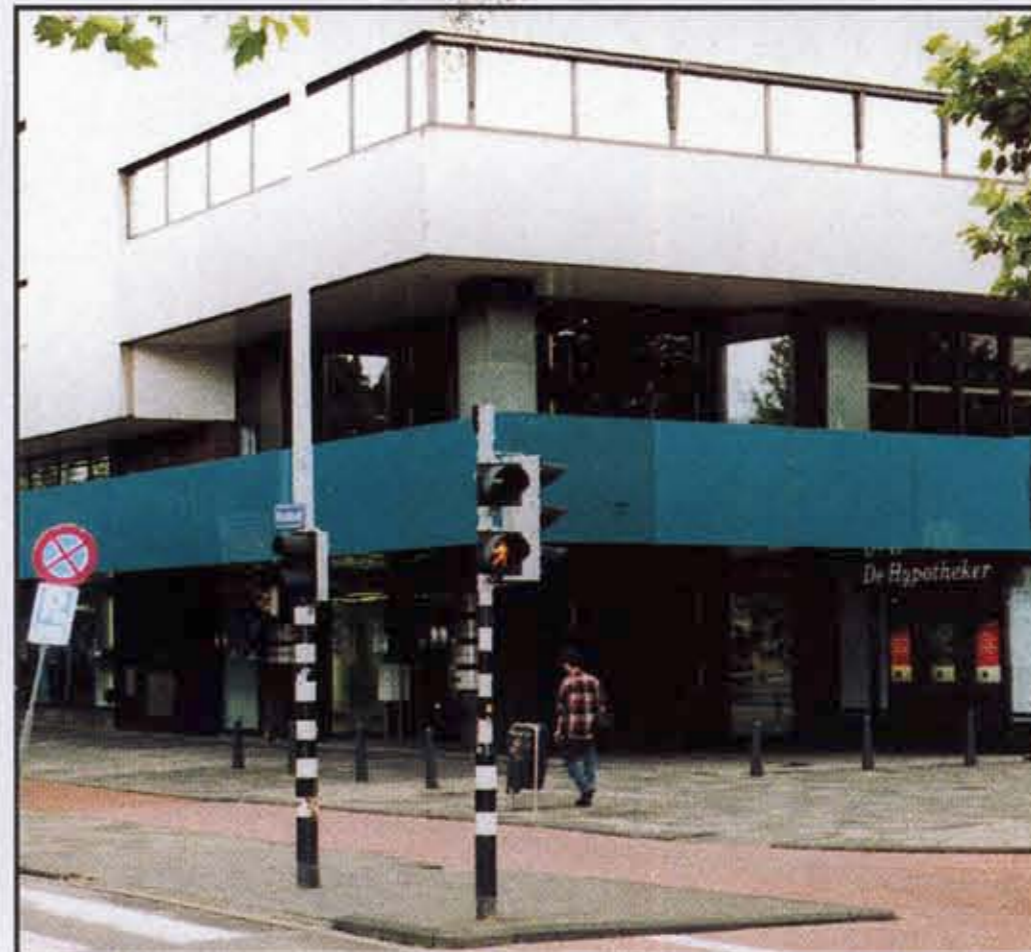
The entrance of the “Sealiner Building”