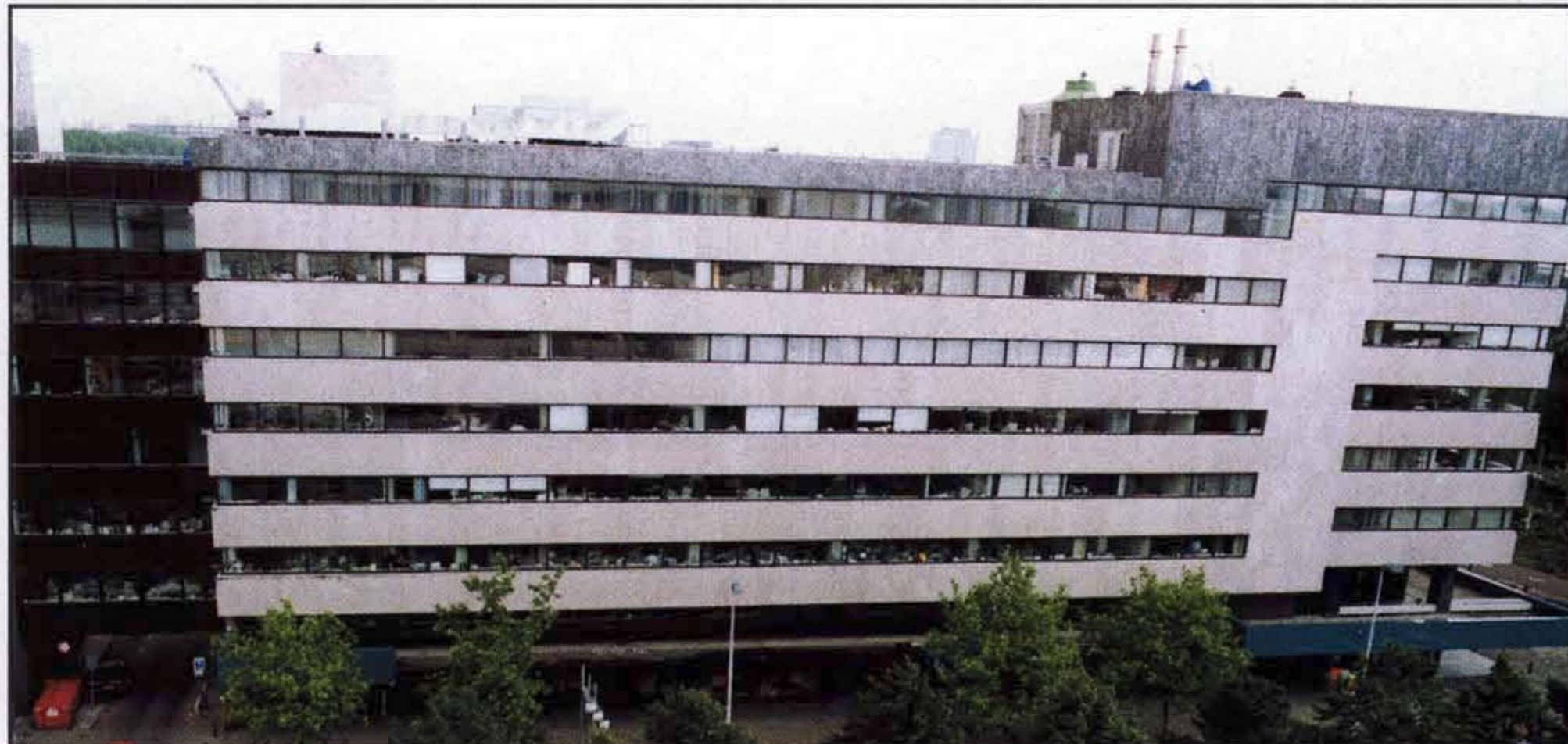
“Sealiner Building” in the centre of Rotterdam. Sealiner’s offices are located on the first and second floors.

Whilst Sealiner was founded in 1984 the actual agency operation only commenced in April 1985 when the first vessel attended to was the Valeria Voy IOR . During the next year the thirty five members of staff handled one hundred and twenty five ships and the staff complement has now grown to one hundred people.