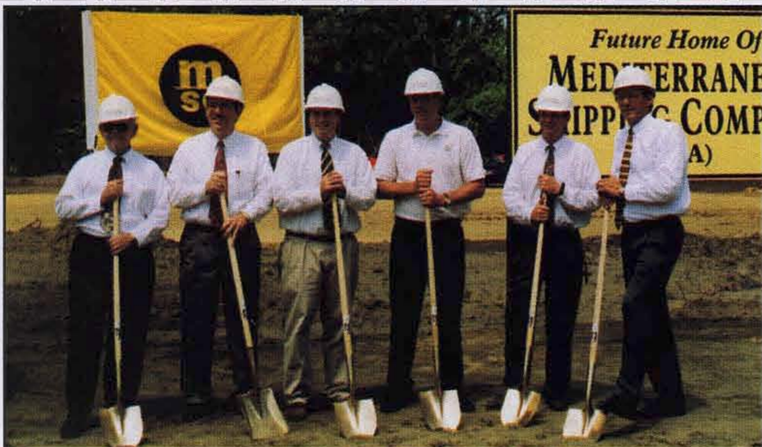
The proud managers of MSC CHARLESTON are pictured above at the ground breaking ceremony for their new office which will be completed early in 1999