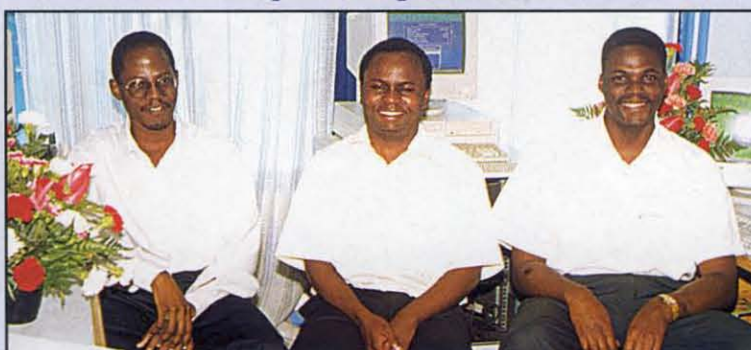
The Computer Team