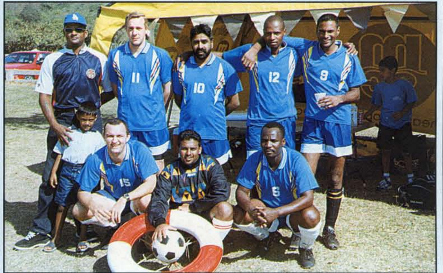
MSC “A” TEAM