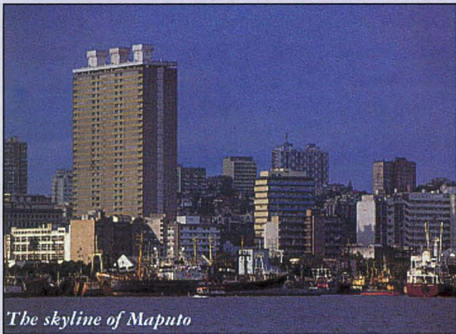
The skyline of Maputo

MSC (Moc) Lda, a subsidiary of MSC South Africa, opened its head office in Maputo on 1st June 1995, which is situated on the fourth floor of the tallest building shown in the picture below. The small but busy Nacala office opened its doors on 1st February 1999.