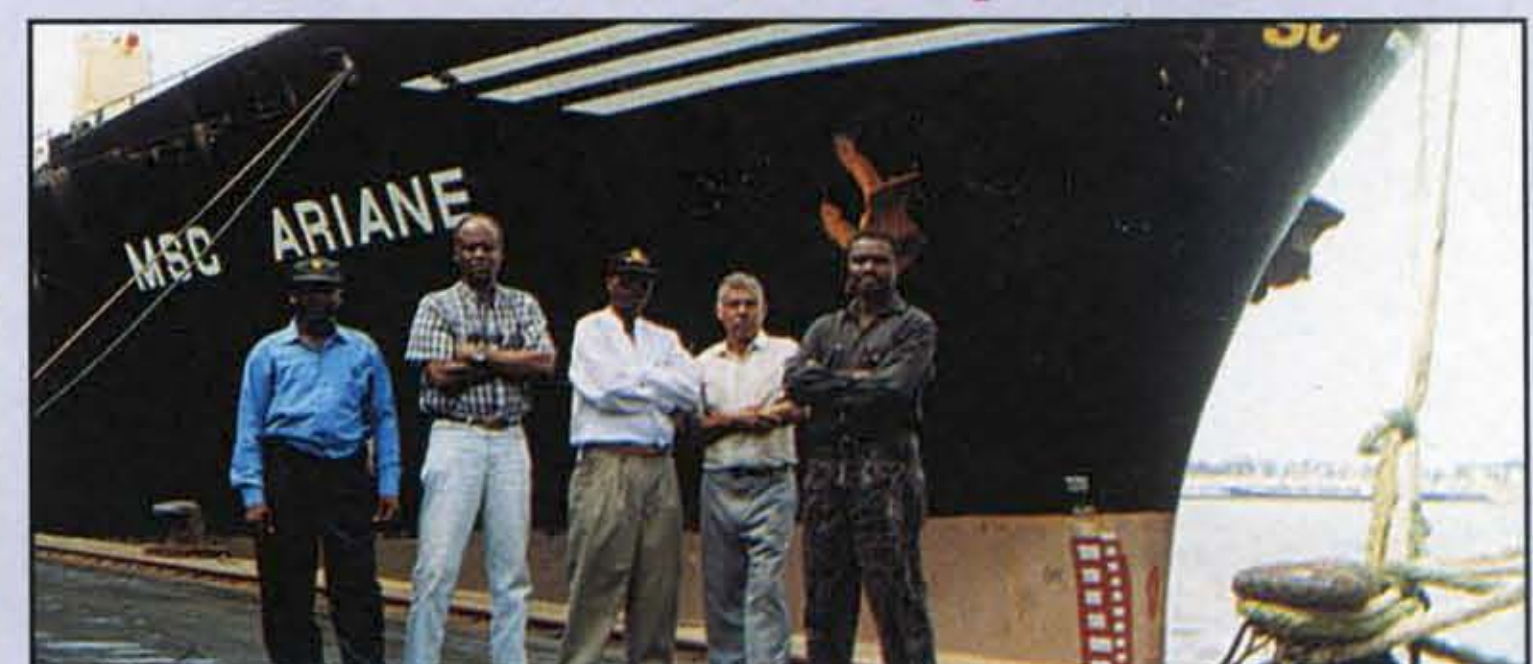
The Operations Team