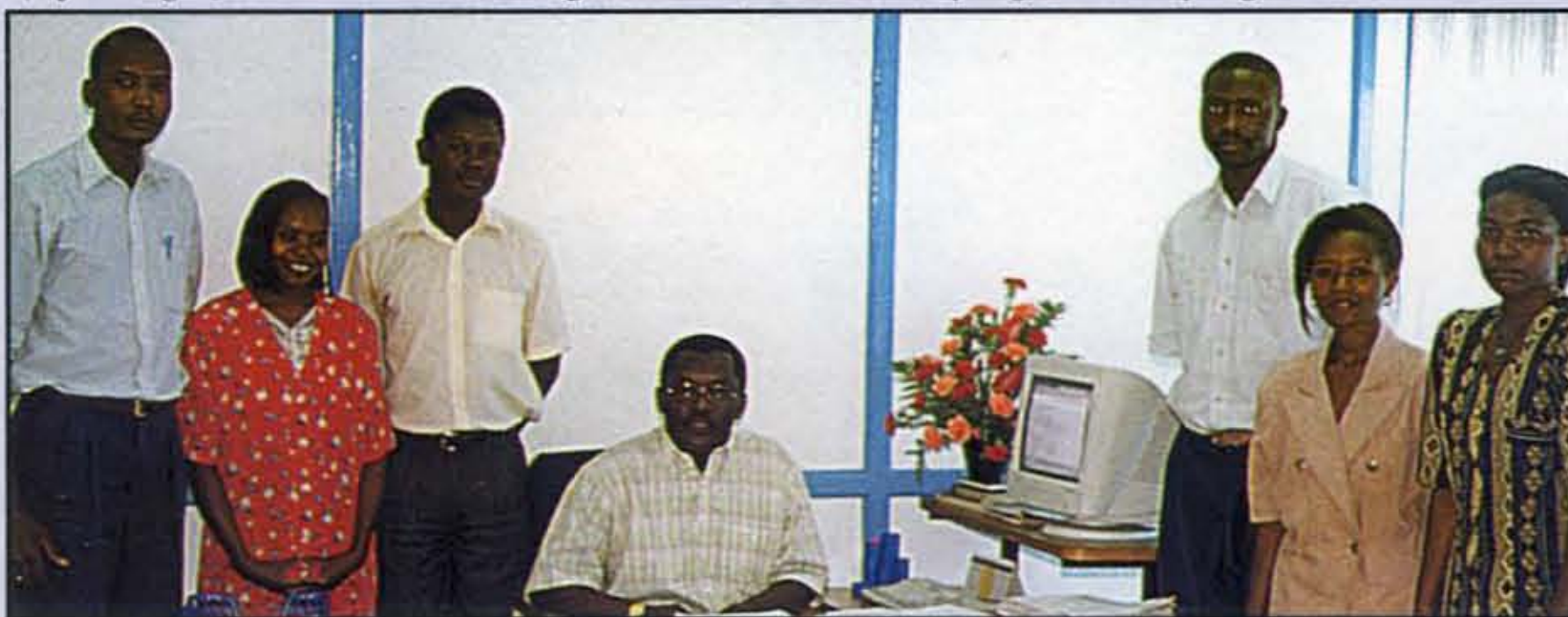
The Container Department