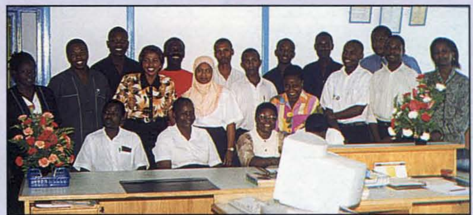
The Administration Department