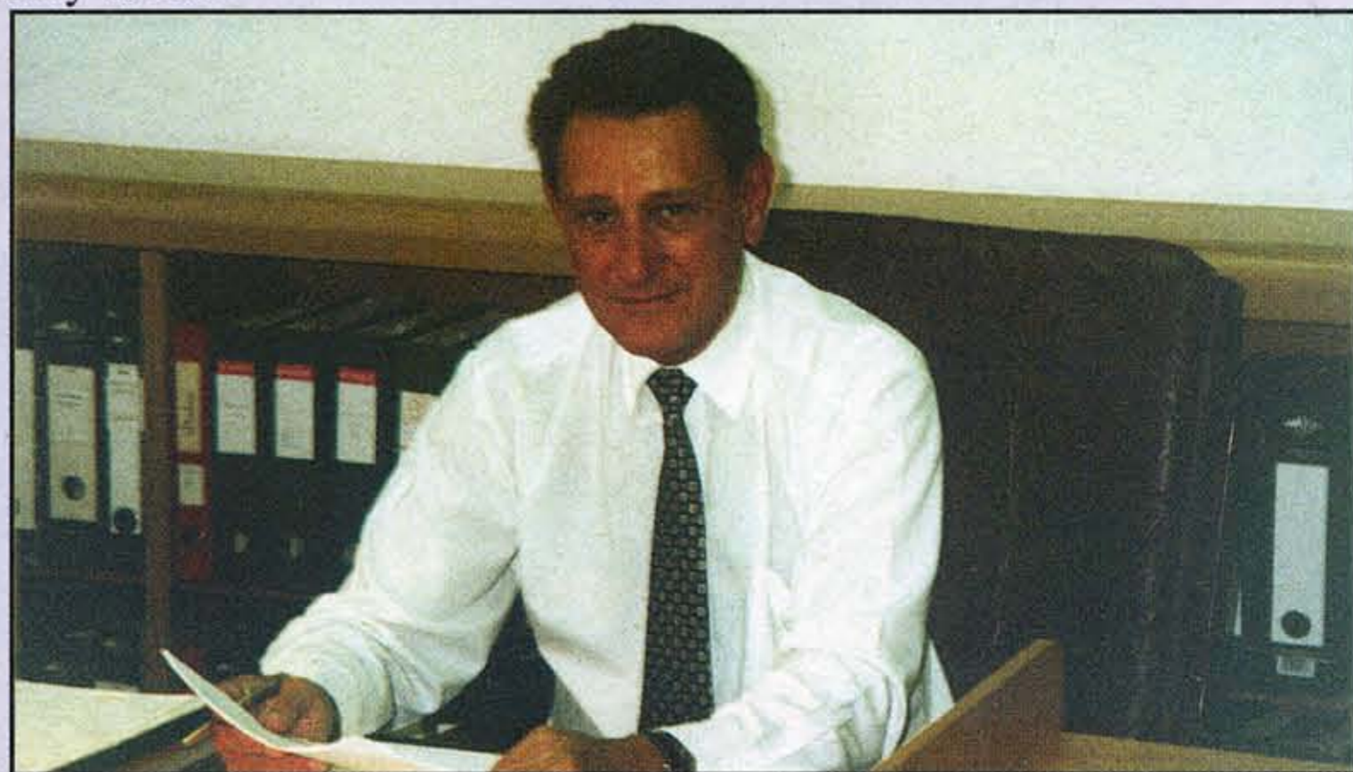
Chairman of MSC Mozambique