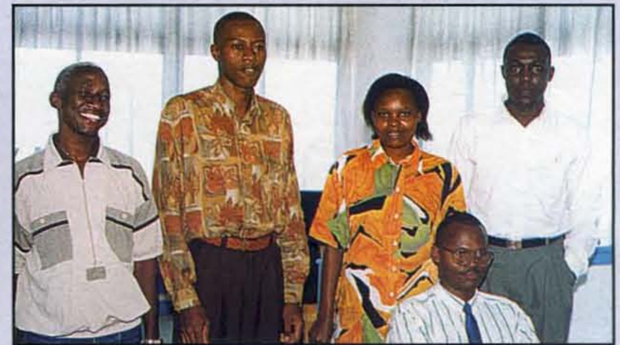
The Export Department