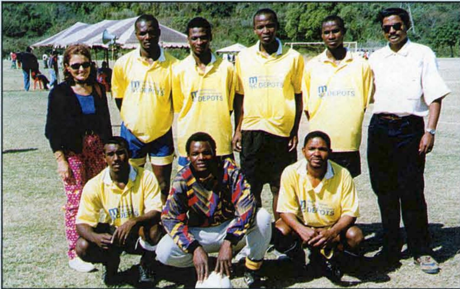
MSC DEPOT – “A” TEAM

All the teams in the Mens Division played admirably but the “Cream of the Crop” was The Depots “A” Team who reached the semi-final and were narrowly defeated by Portnet on a penalty shoot-out – Final score 3–2.