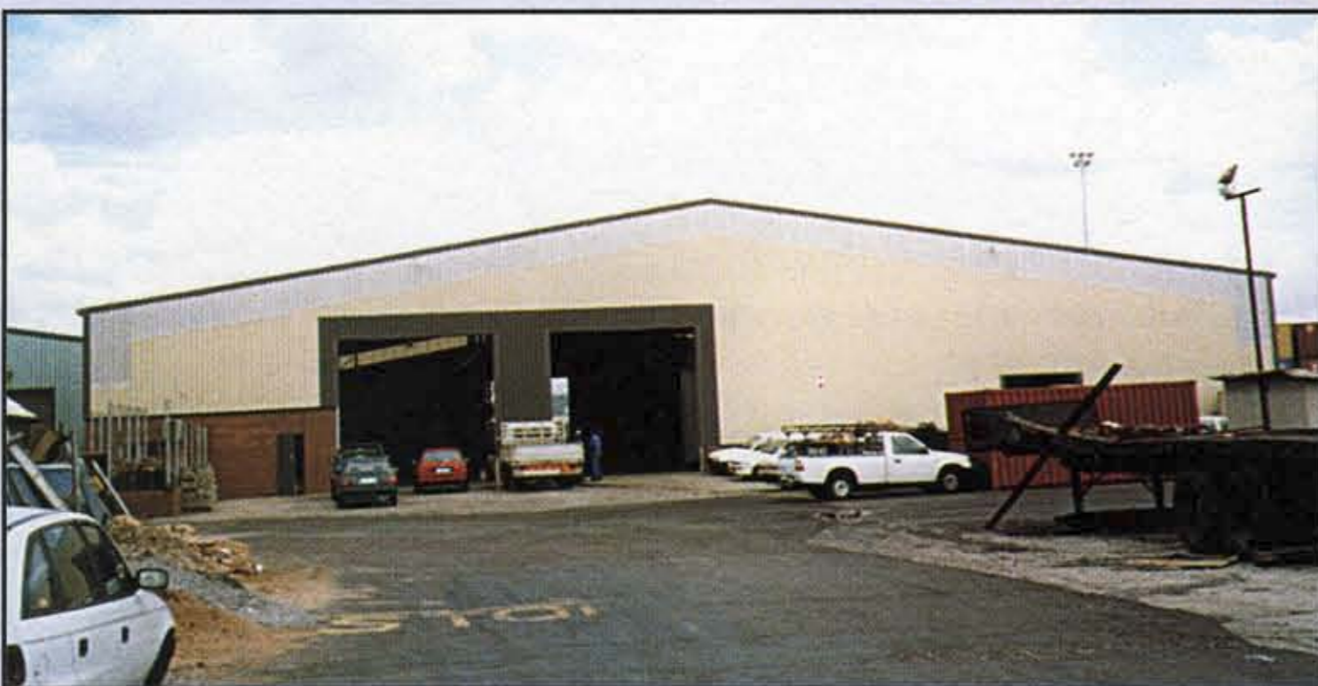
A view of the workshop structure. The empty container depot is situated to the left and the full container depot to the right.