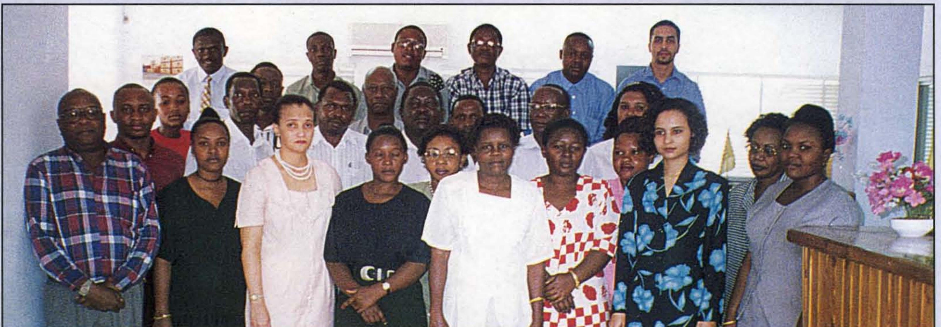
Staff Members (MSC Group)