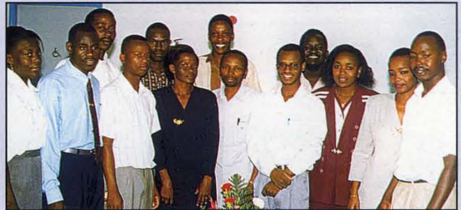
The Accounts Department