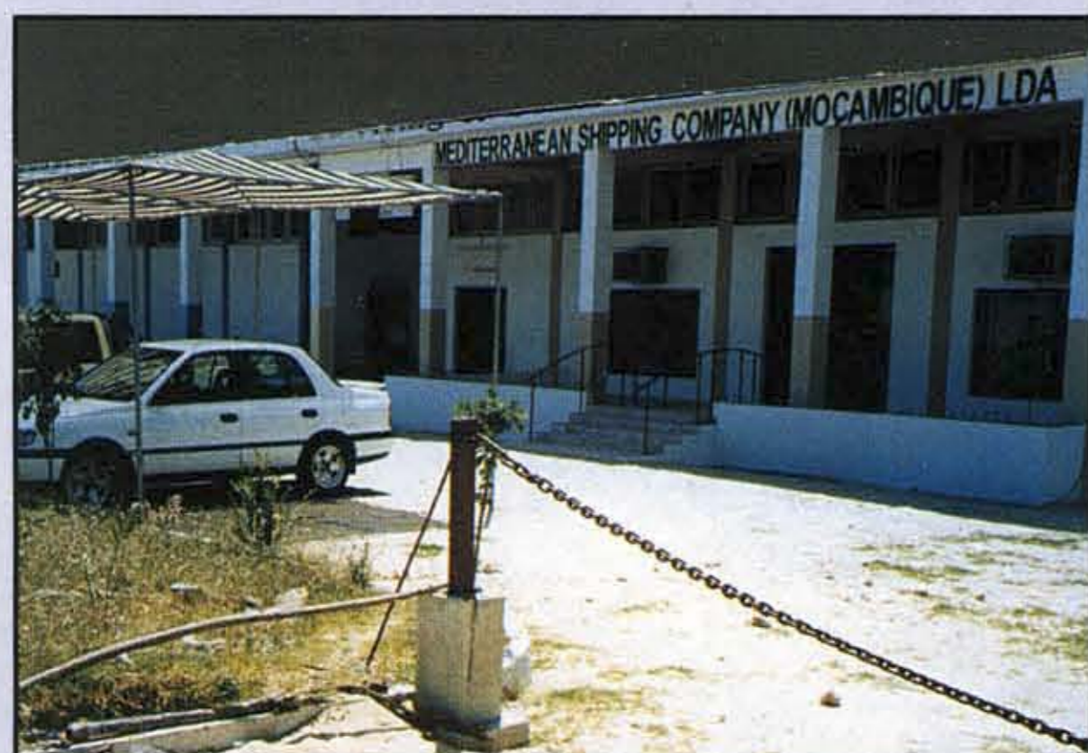
The Smallest Office