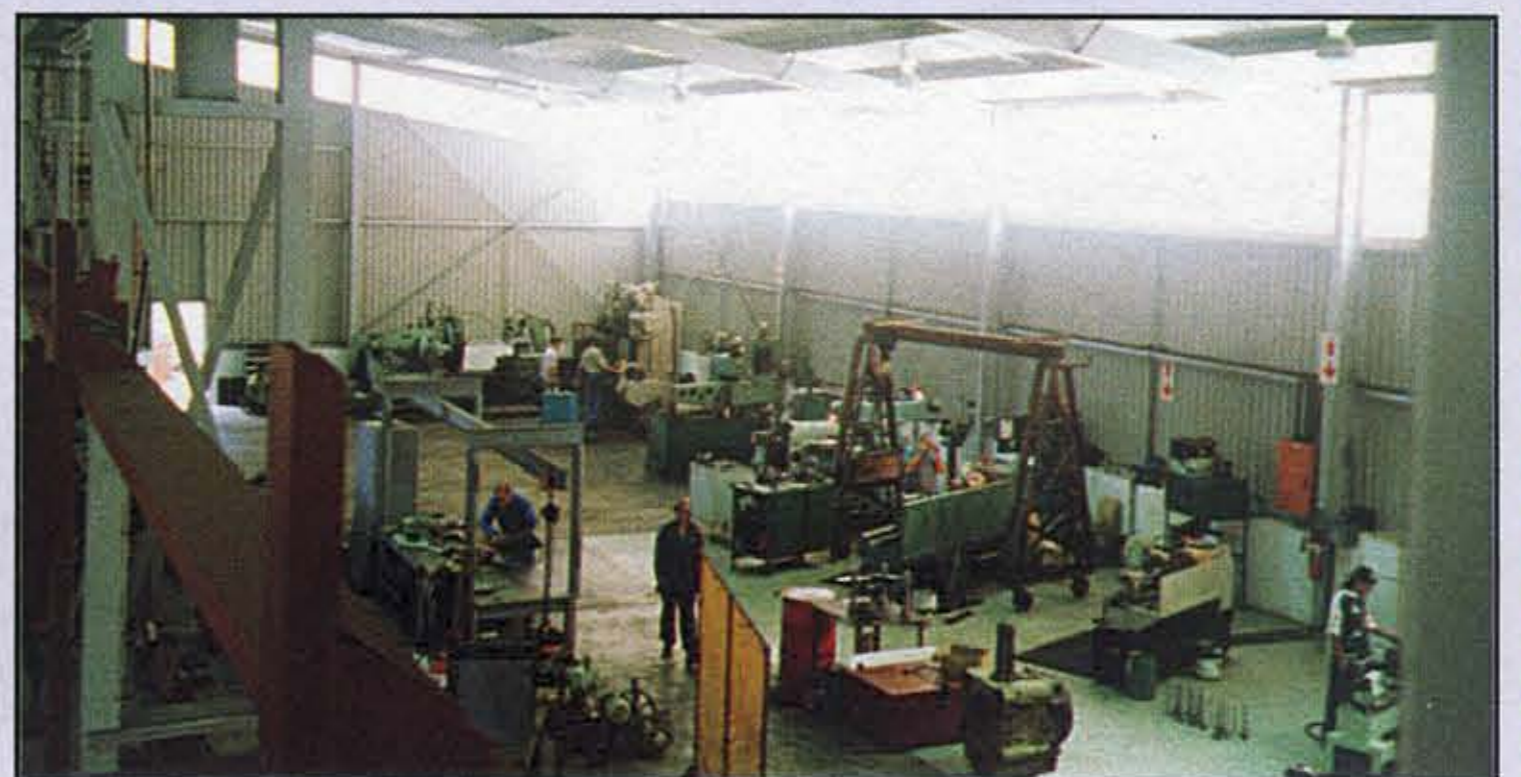
Views of the workshop floor