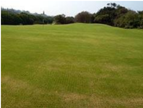
Beachwood 8th Green - Hollow Tine

As most are aware, Beachwood conducted its annual Spring Treatment on the 15th & 16th September 2014. The treatment went well, showing early signs of improvement not only to the Green's but the Tee's and Fairways. The below pictures illustrate the work done to the Green's and Tee's.