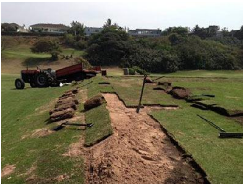
Beachwood 18th Tee - Re Level Championship Tee Box

As mentioned the above pictures illustrate the extensive annual treatment done to the Beachwood Golf Course. I would like to commend the Green Staff on their hard work over the