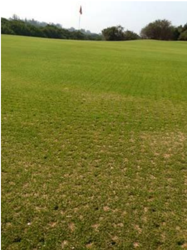
Beachwood 8th Green - Close up on Hollow Tine