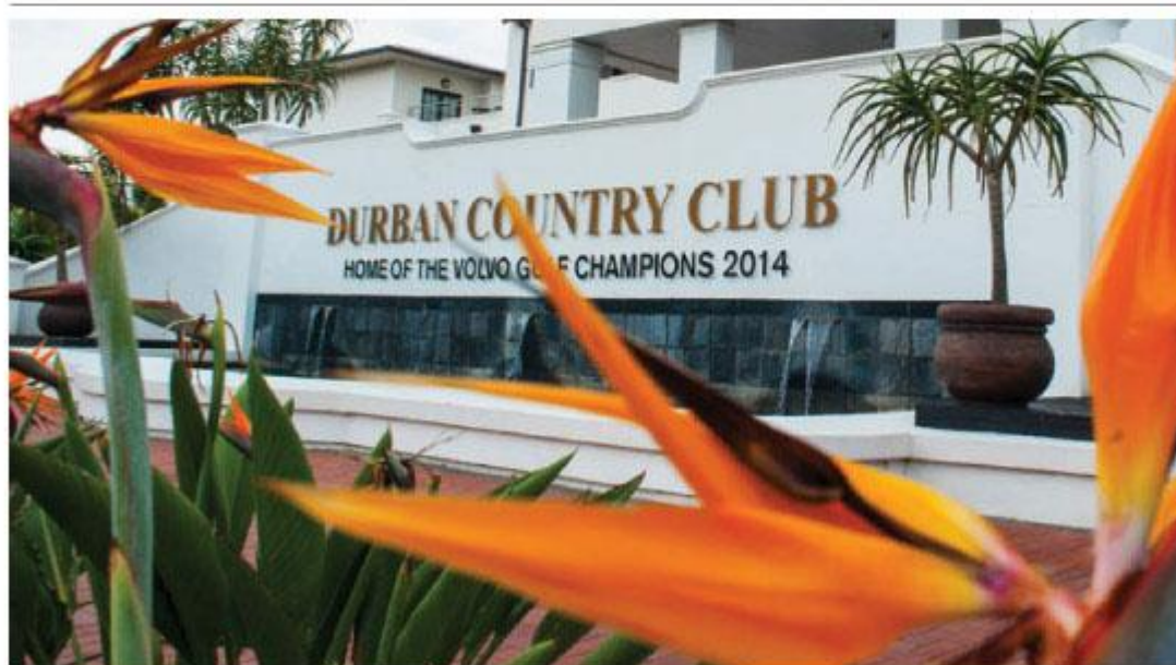
HOME OF THE VOLVO GOLF CHAMPIONS TOURNAMENT 2013/14 AND HOST TO 17 S