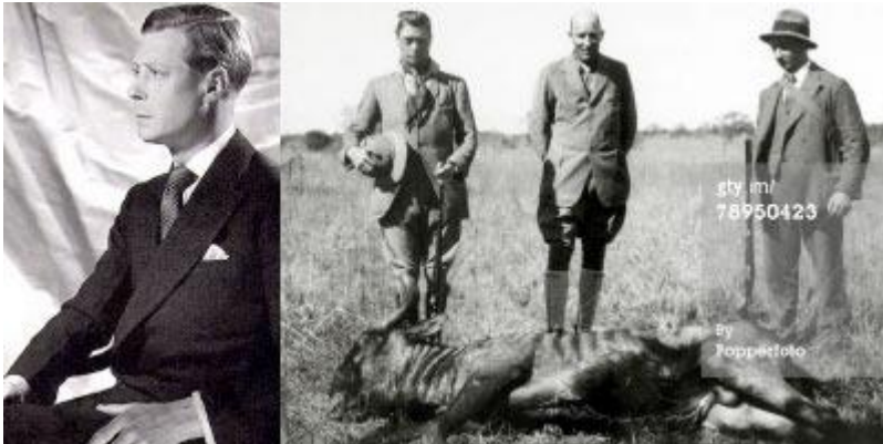
Left- Portrait of HRH Edward, Prince of Wales, and pictured above HRH is on the left, near Bulawayo, Southern Rhodesia in 1925. having just shot a wildebeest at the central estate. The Prince of Wales (1894-1972) was to become King Edward VIII for a short while in 1936.