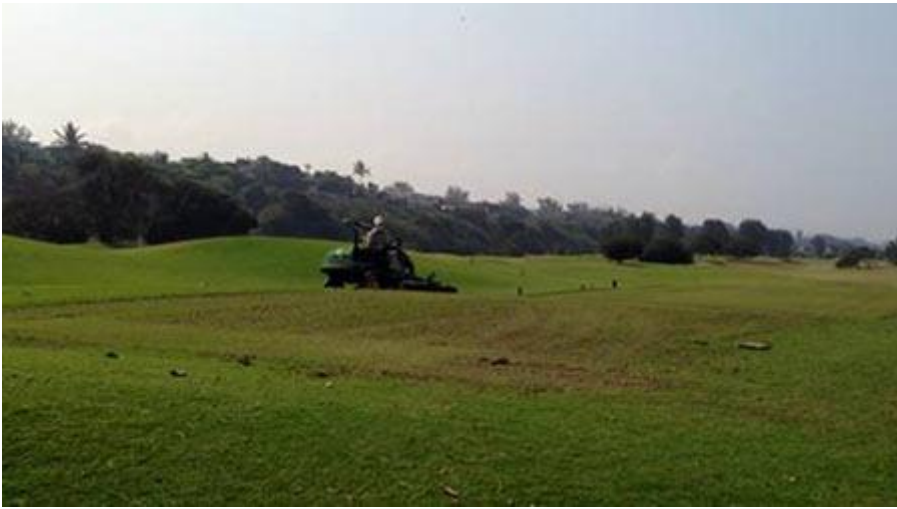
Beachwood 11th Tee - Extensive Hollow Tine on All Tee Box's