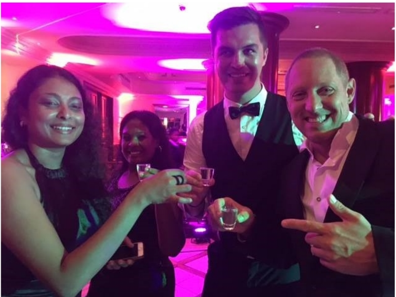
Relaunch of Durban's 105 year old Grande Dame Protea Hotel Edward

Durban's Protea Hotel Edward offers additional luxury in its 30 new rooms & another 3 boardrooms