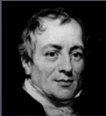
David Ricardo 1772-1823